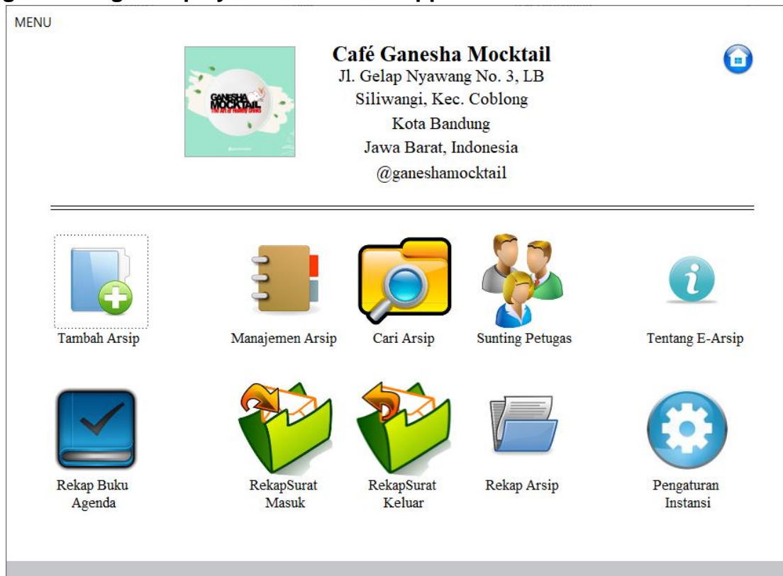
Figure 3. Menu display on the Café Ganesha Mocktail Archive Application

The archive application display of Café Ganesha Mocktail that has been developed has several interesting menus with the following functions, namely, (1) the add archive feature, this feature functions to add incoming and outgoing archive data; archive management feature, this feature can be used to view, edit and add incoming and outgoing mail data, but it can also be used to print dispositions, this feature is also used to view, edit and add archive retention data and borrowed letters; (2) archive management feature, this feature can be used to view, edit and add incoming and outgoing mail data, but it can also be used to print dispositions, this feature is also used to view, edit and add archive and letter retention data borrowed; (3) archive search feature, this feature can be used to search for required archives both incoming and outgoing archives; (4) the officer edit feature, can be used to edit the officer's name as a means to enter the application; (5) features regarding e-archives, a feature that presents the name of the archive developer; (6) agenda book recap feature, useful for viewing incoming and outgoing archives; (7) incoming mail recap feature, useful for viewing incoming letters/files at the place of business; (8) outgoing mail feature, useful for viewing letters/files leaving the place of business; (9) archive recap feature, useful for viewing archives that enter the company; (10) agency settings feature, useful for editing business identity.