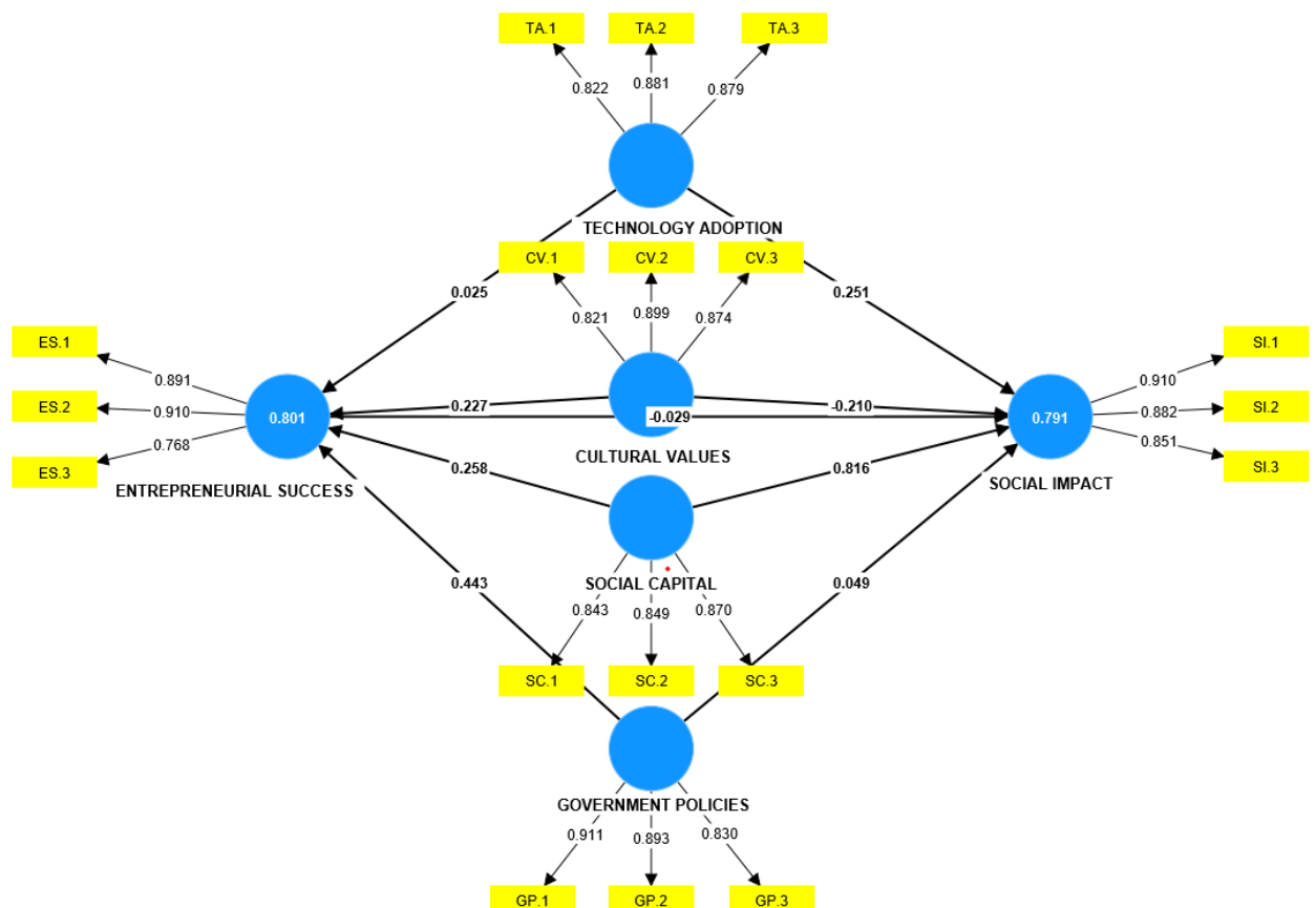
Figure 2. Internal Model Assessment

The majority of the relationships in the structural model do not have multicollinearity as a serious problem because the relationships' VIF values social capital (SC), government policies (GP), entrepreneurial success (ES), cultural values (CV), social impact (SI), and technological adoption (TA) all fall short of the necessary 3.00 level (Hair et al., 2019).